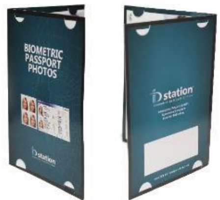
Australia Passport Example

Contact our sales team for a free sample of our new Passport Photo Wallets.